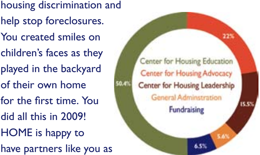
Dollars well spent

Thank you for making Virginia a better place to live.