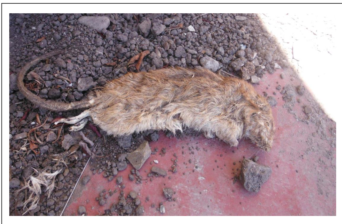
Figure 1 - This dead rat was found in the driveway of a Fannie Mae foreclosure in Richmond, CA in 2013

According to PestWorld.org news, a foreclosed home that is empty and uncared-for can attract a variety of pests, including termites, spiders, ants, mosquitoes, stinging insects and rodents. An overgrown or unkempt yard, for example, can harbor many more pests than a well-groomed yard. Small holes in siding, rips in screens, broken window glass, and cracks in the foundation provide easy access inside for pests. A rodent infestation is especially likely to spread from a foreclosed home to other nearby houses. Once rodents do invade a home, they can pose serious health and property risks. Rodents contaminate food and spread diseases like Hantavirus, a viral disease that can be contracted through direct contact with, or inhalation of, aerosolized infected rodent urine, saliva, or droppings. A number of Fannie Mae's foreclosed properties were infested with rats upon inspection.